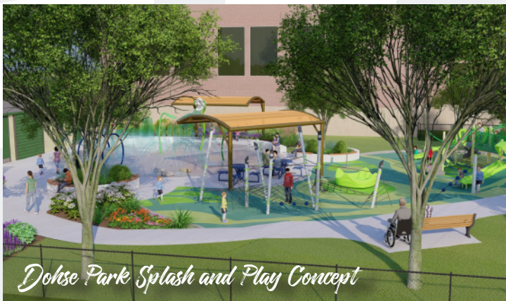
Dohse Park Splash and Play Concept